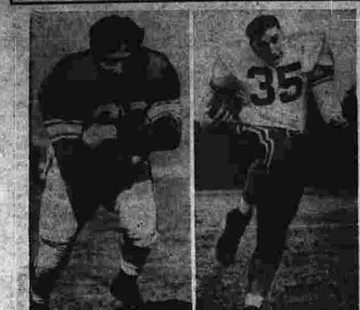
Left to right, hit hard for Michigan State, Wisconsin and Notre Dame, respectively.