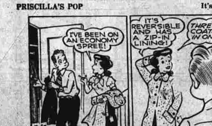
BY LESLIE TURNER