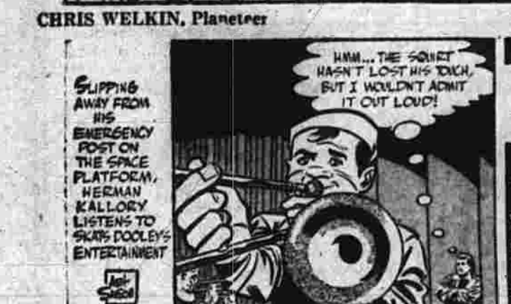
BY AL VERMEER